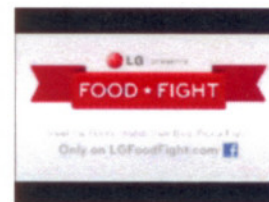
LG Electronics Introduces Innovative 'Door-in-Door' French-Door Refrigerator